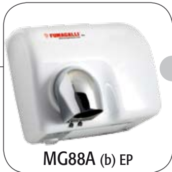
MG88A (b) EP