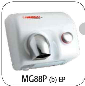
MG88P (b) EP

WARM AIR HAND DRYERS MG 450 ECO LEM New generation: increased performances for reduced drying time. Using less energy and ecologically regenerable.